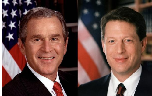
George W. Bush

The Republican Party went through a volatile series of debates between John McCain (Senator from Arizona) and the Texas Governor George W. Bush (the son of the former President). It was George W. Bush who was finally endorsed as the Republican Candidate.