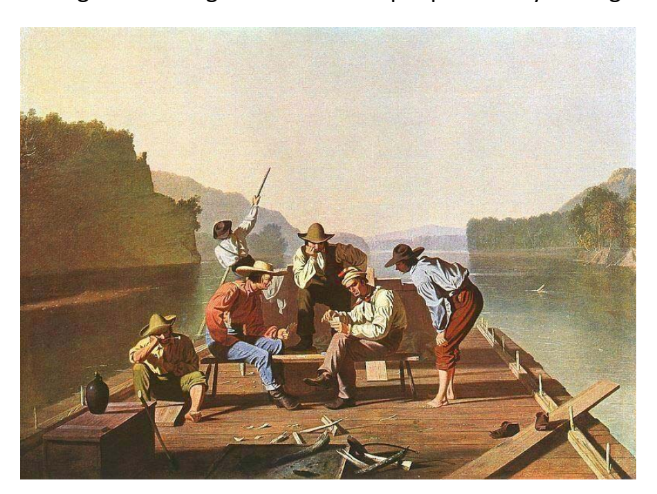
George Caleb Bingham – Common people in daily settings

This was an era of Genre Painting (art showing everyday life of ordinary people). Below are some of the most notable painters during this period.