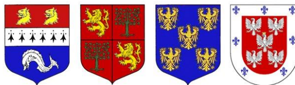
Coats of Arms for descendants of Don Abraham Senior Coronel

In addition, an excellent reading source about finding Don Abraham's secret shul from 1492: http://melbourneblogger.blogspot.com/2011/02/segovias-secret-synagogue-revealed.html