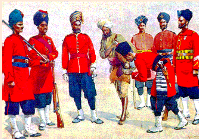
Picture of Raj Soldiers