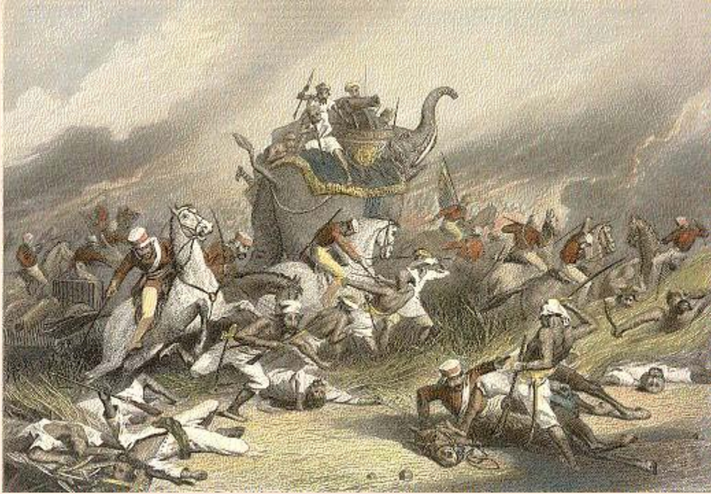
Copy of a painting depicting the Sepoy Rebellion