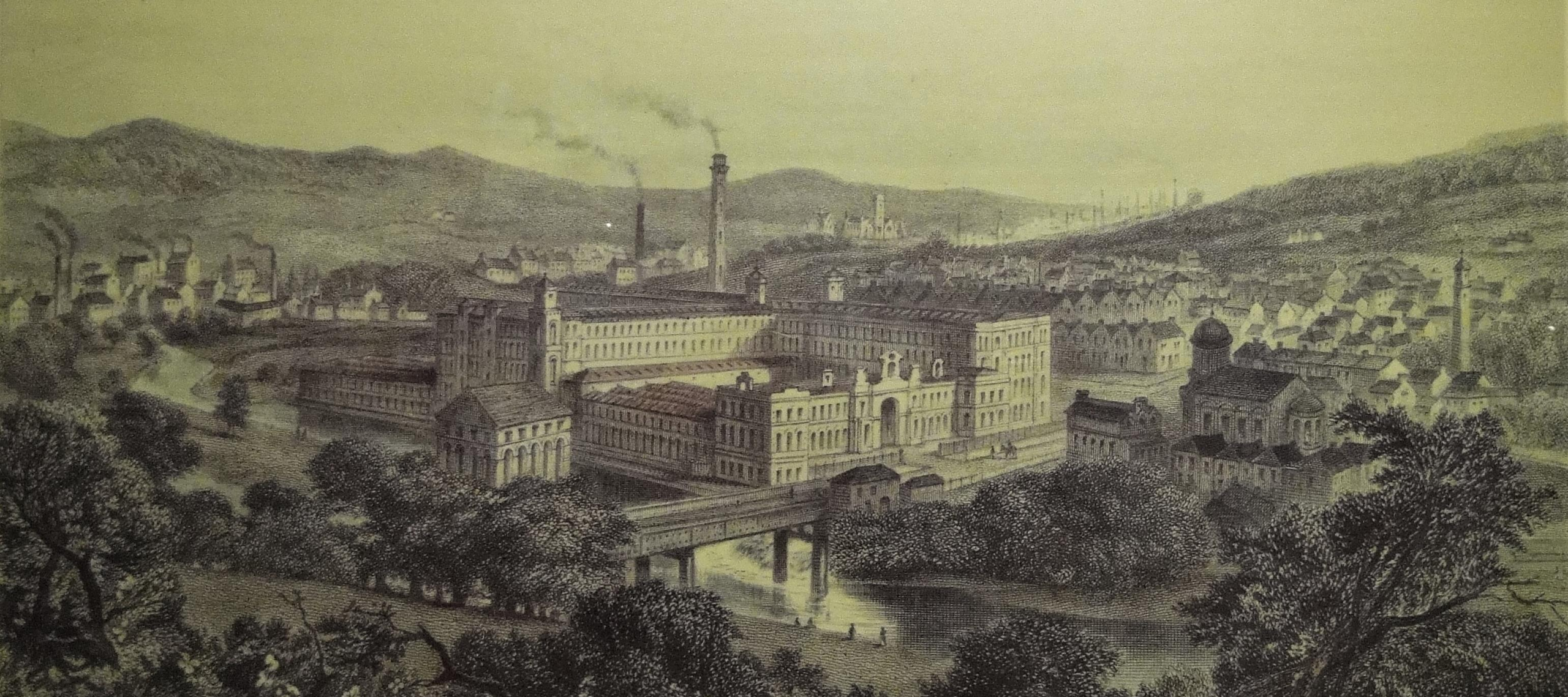
Saltaire, a mill town in West Yorkshire, England