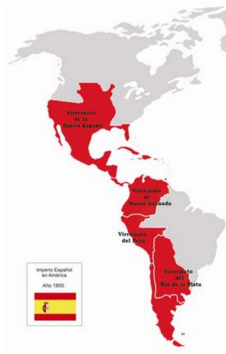
Spanish America in 1800, with four kingdoms: New Spain, New Granada, Peru and La Plata