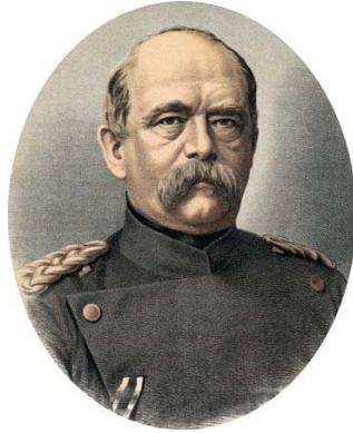
Otto von Bismarck

In his first speech as prime minister, he told the parliament of his intentions and then added the following phrase:-