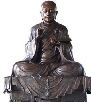
[Statue of Xuanzang]

The rest of Xuanzang's life was spent in teaching, advising and translating manuscripts that made the journey home with him. Following his journey, Buddhism became more prevalent and more widely understood in China and subsequently elsewhere in the world. The record of his pilgrimage helps us to study and understand Buddhism and the cultures along the Silk Roads.